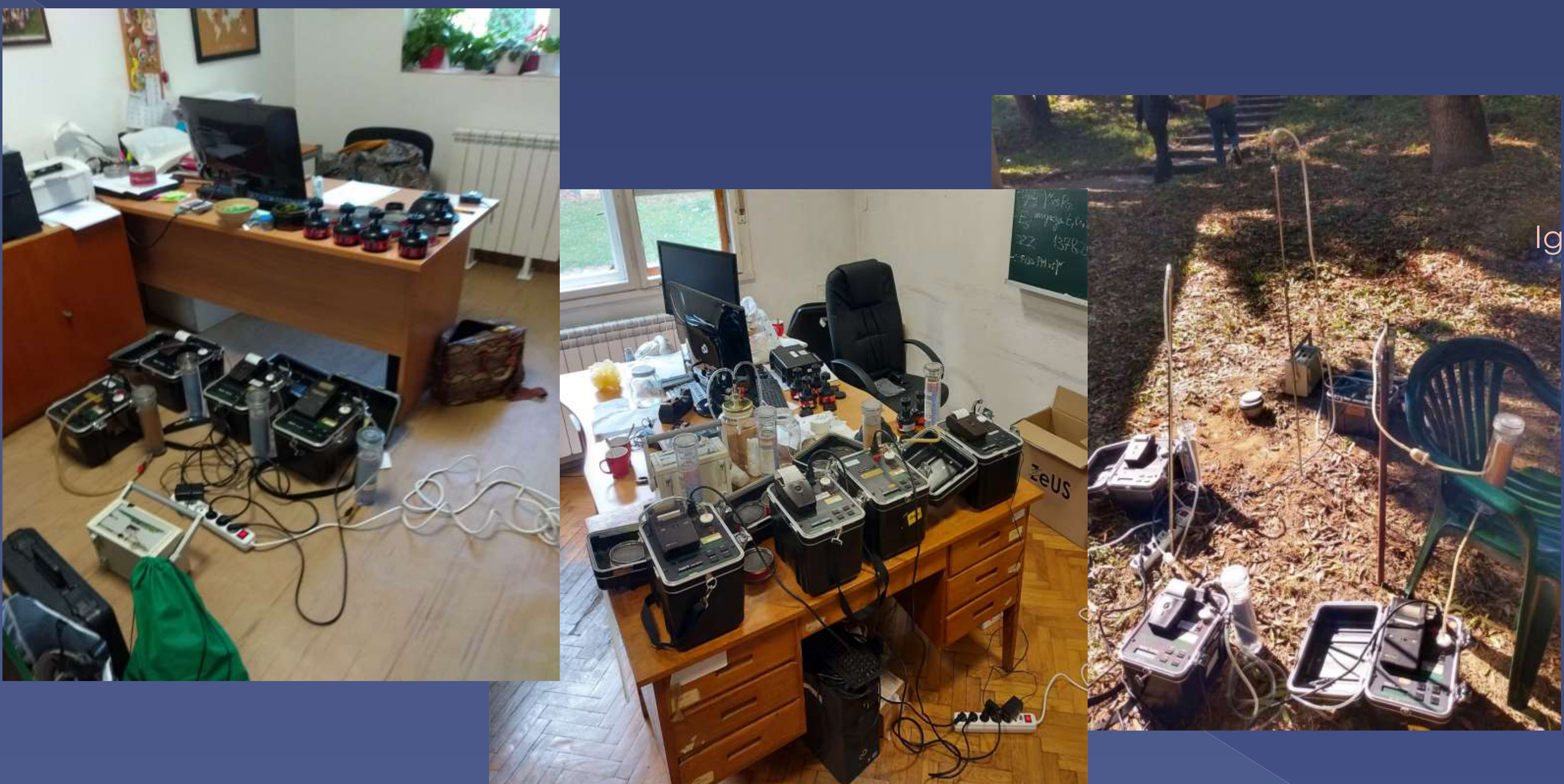
Experimental arrangements for indoor radon measurements (two location) and one location for measurement of radon concentration in soil